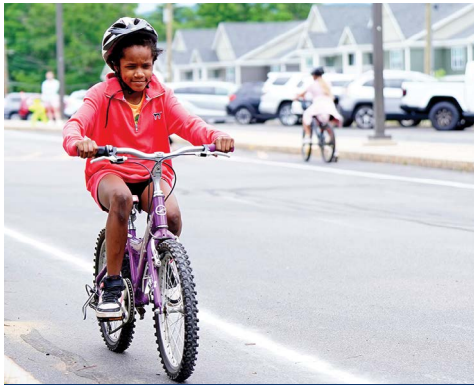
Learning Beyond the Classroom