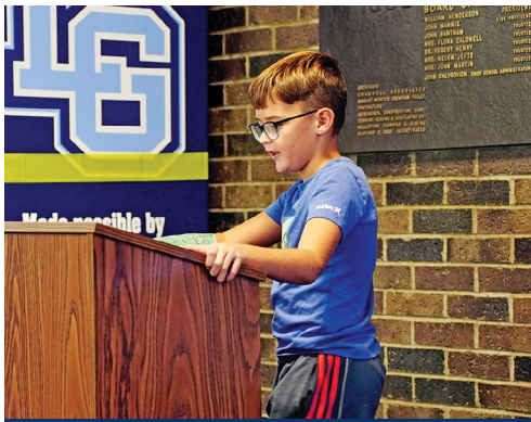
Empowered to Lead