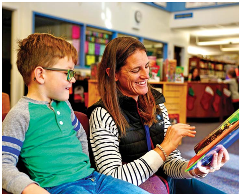
Creating Confident Readers