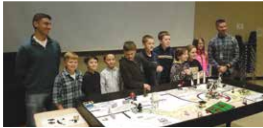
First Lego League Team picture.