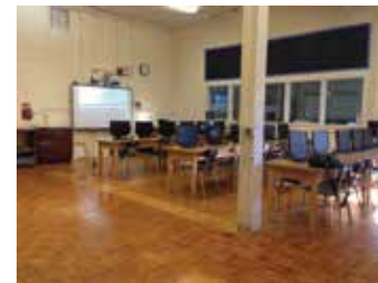
Jr.-Sr. High School Technology Learning Space