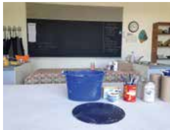
Jr.-Sr. High School Art Room